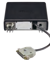
Optional OPC-2078 installation image