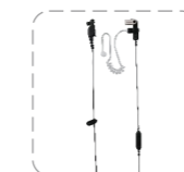
Earpiece with Transparent Acoustic Tube