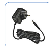
Power Adapter 12V/1A