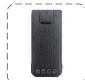
Li-ion Battery 2200mAh