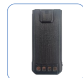
Li-ion Battery 1500mAh

STANDARD ACCESSORIES: OPTIONAL ACCESSORIES: