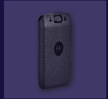
HKNN4013ASP01 BT90 STANDARD CAPACITY BATTERY